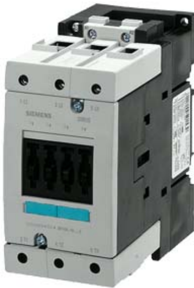
CONTACTOR, AC-3 30 KW/400 V, AC 230 V, 50 HZ, 3-POLE, SIZE S3, SCREW CONNECTION